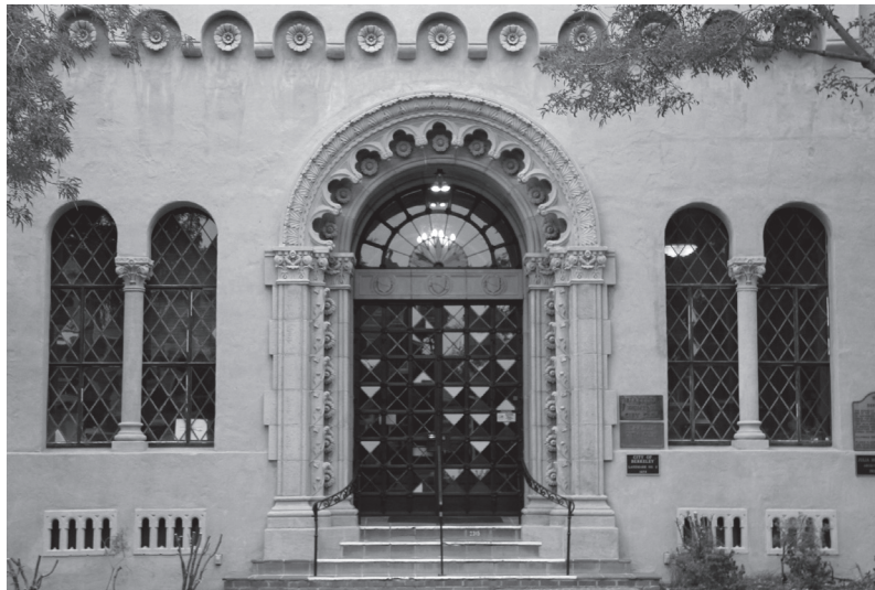
Our façade, lovingly restored.