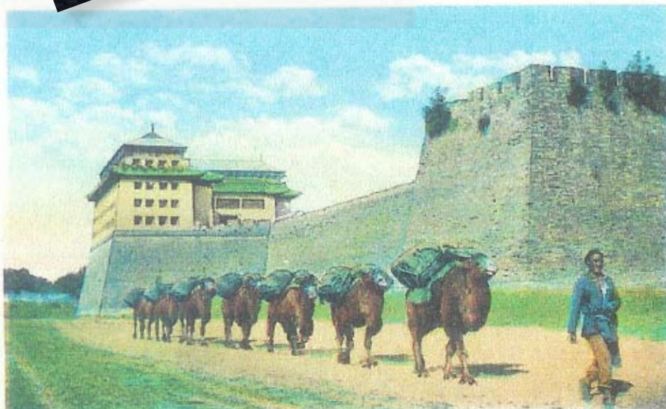
CORNER BLOCK HOUSE, TARTAR WALL, PEKING.