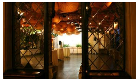
Dancing on the Terrace.