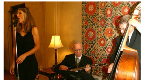
The band plays on.