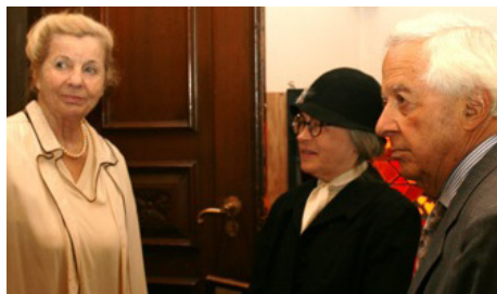
Guests meet “Miss Morgan”.