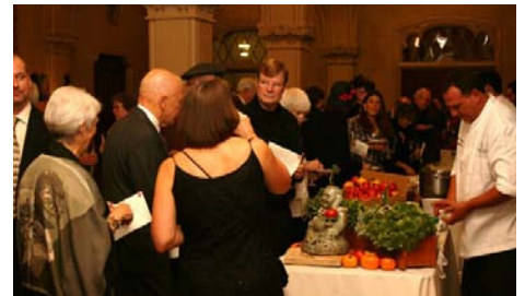
The City Club glows with pride.