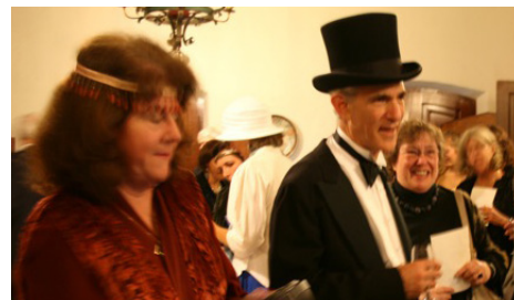
Top an’ all.