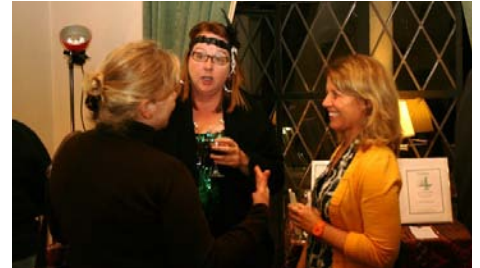
Guests mix and mingle.