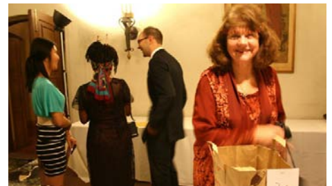
One very happy bidder.