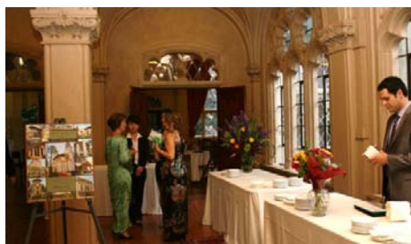
Board members ready to meet guests.