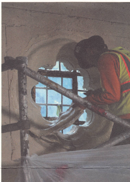
Rainbow Waterproofing casting the mold for the rosettes.

Historical Note: The Berkeley City Club Conservancy had recent experience with Rainbow Waterproofing on the building's street facade, which required repairing the unique sand-washed stucco finishes specified by Morgan and restoring the decorative motifs. It takes great skill to blend, apply and, at a certain stage of hardening, to wash away enough of the mortar to expose the bits of sand, shells, the coal and carbon that make up the stucco.