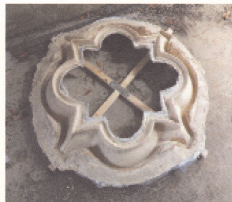
The new rosette in its mold lying out to dry.

The poolroom project demonstrates the effectiveness of cooperation between the Berkeley City Club Conservancy and the Berkeley City Club. The ventilation work was spearheaded by the Conservancy and the window rosette restorations by the Berkeley City Club. We are all proud of