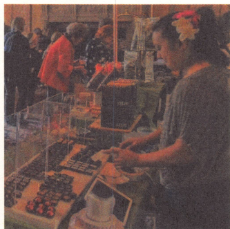
Chocolate sampling in progress.