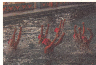
Synchronized swimmers.