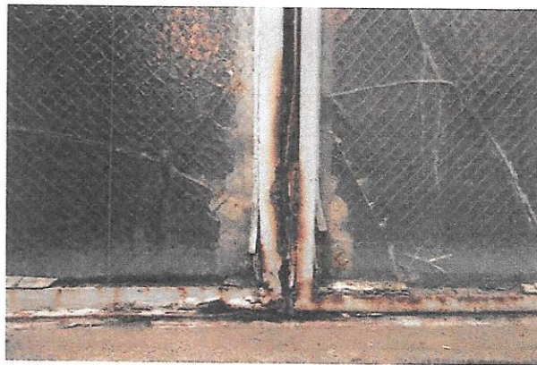
Severe Corrosion in Pool Window.

What will it take to restore these window arcades to their original beauty? As a test case, the Berkeley City Club Conservancy funded a grant to replace one set of pool windows, those opening onto the west side of the pool from the Loggia. The winning bid for the restoration went to Susan Wagner Design of Santa